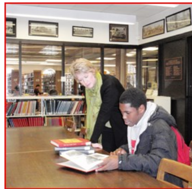
Assistance is always available in the Marx Room.

For those who cannot make a personal visit to Easton, the library will answer letters. A succinct inquiry is best. Include a self-addressed, stamped envelope to receive a reply. There is a $1.00 charge for each photocopy from the Library's printed collections.