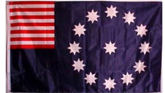
THE EASTON FLAG LOCATED IN THE MARX ROOM