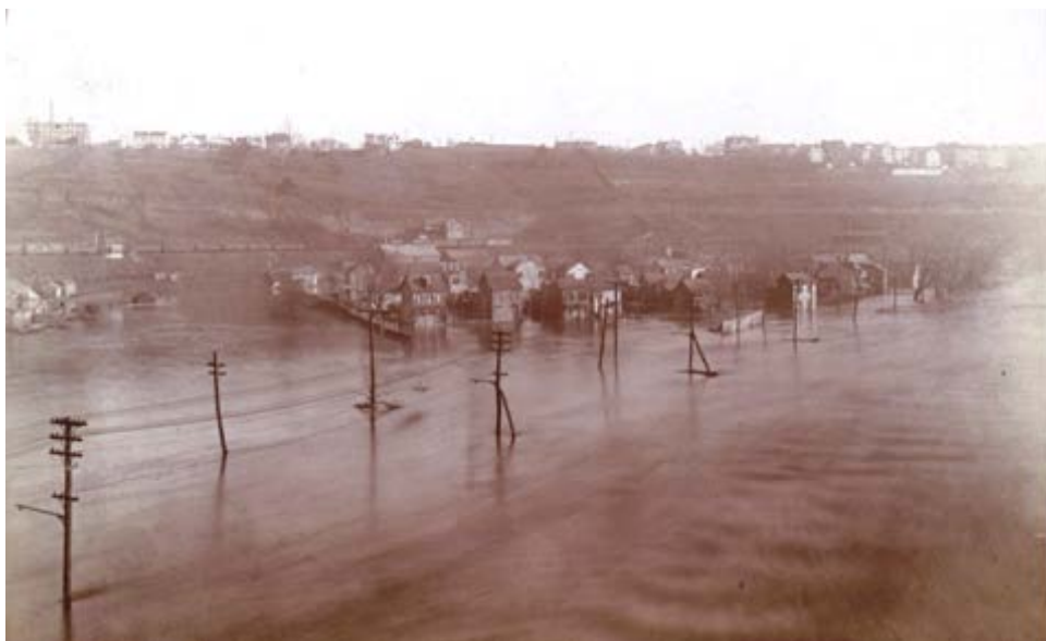
Flooding on the Lehigh River, 1903