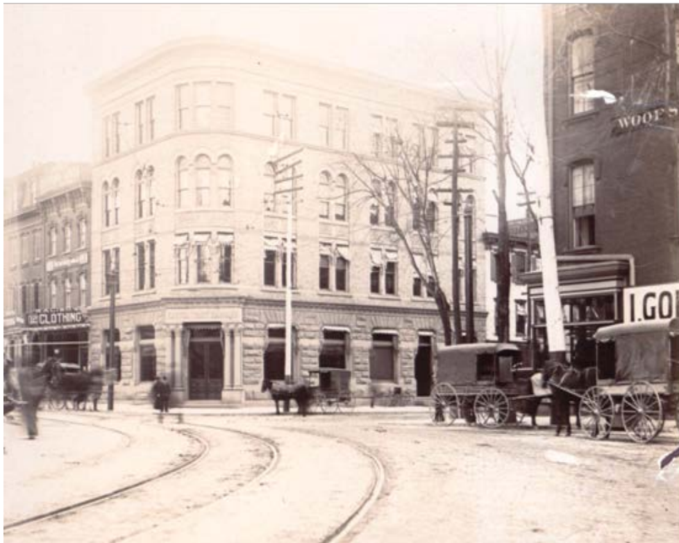
Easton Trust Company, Easton, PA about 1900