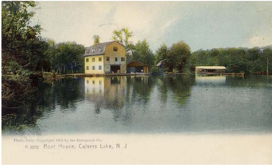
Photo. Only. 6 5859 Boat House, Culvers Lake, N. J.