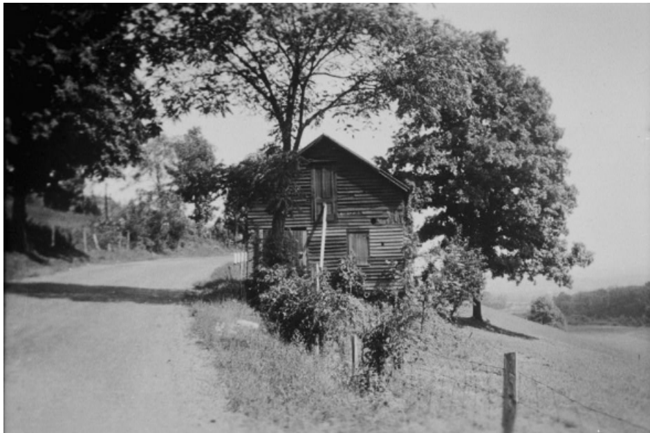
Samuel Michael Schoolhouse, Shawnee on Delaware, Monroe County, PA