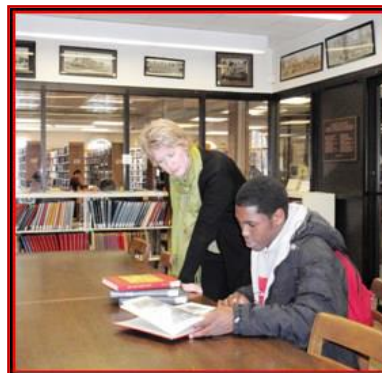
Assistance is always available in the Marx Room.

For those who cannot make a personal visit to Easton, the library will answer letters. A succinct inquiry is best. Include a self-addressed, stamped envelope to receive a reply. There is a $1.00 charge for each photocopy from the Library's printed collections.